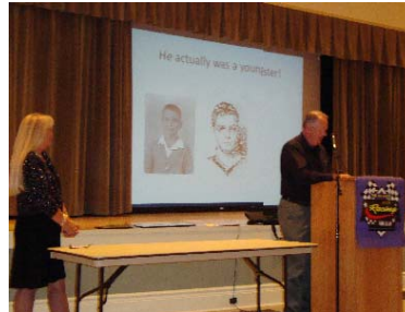
Glen's Future Racing Plans