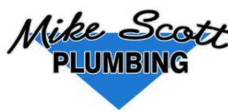
Platinum Sponsor Mike Scott Plumbing Wildwood, FL 352-748-9111