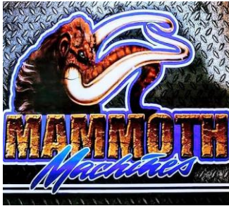
Mammoth Machines Leesburg, FL 407-235-5282

We would like to thank our sponsors for their support. We ask that you please support these businesses so that they can continue to be a vital part of The Villages Motor Racing Fan Club.