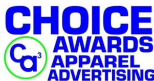
Choice Awards Bellevue, FL 352-245-4496