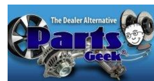
Parts Geek Doylestown, PA 800-541-9352