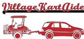
Gold Sponsor Village Kart Aide The Villages, FL 352-409-5853