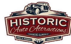
Historic Auto Attractions Roscoe, IL 815-389-7917