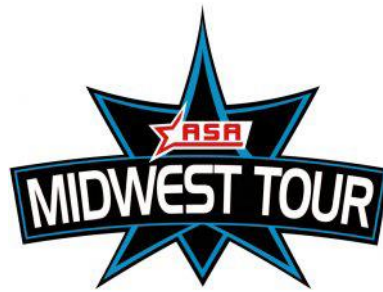
ASA Midwest Tour