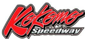
Kokomo Speedway Kokomo, IN 765-459-3877