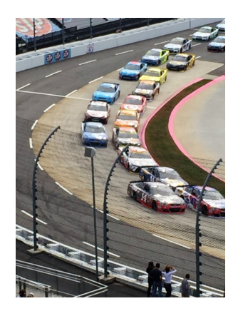
Martinsville International Speedway Oct 29 & 30, 2016