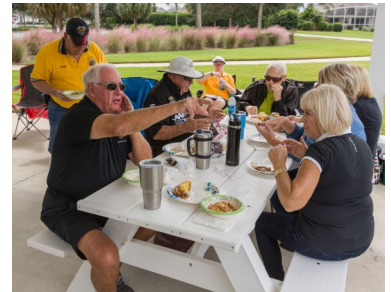
We ate (of course)