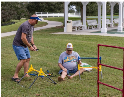
We tried to put games together