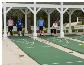
We played Shuffleboard