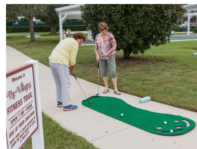
We played golf