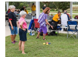
We played Bocce