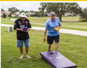
We played Corn Hole