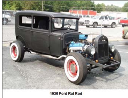
1930 Ford Rat Rod