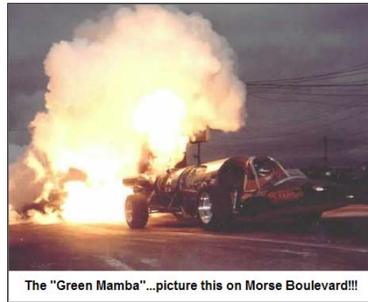
The "Green Mamba"...picture this on Morse Boulevard!!!