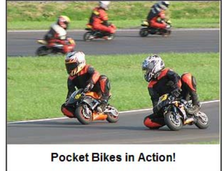
Pocket Bikes in Action!