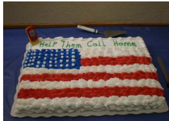
Just like in The Villages, there was food!