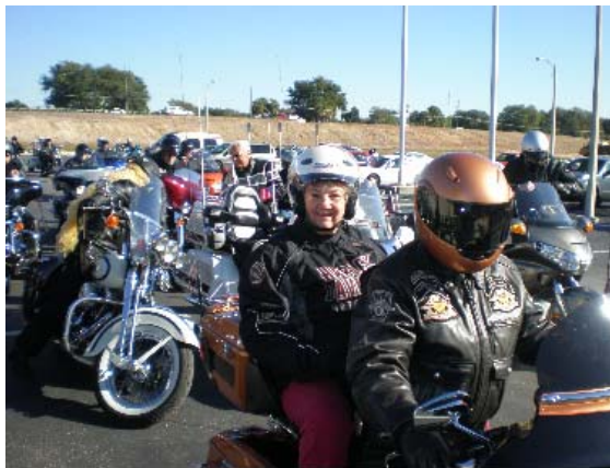
Silky on the motorcycle ride-in