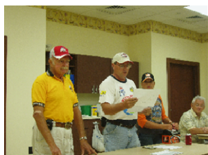
Exactly where are we supposed to go?