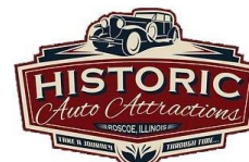
Historic Auto Attractions Roscoe, IL 815-389-7917