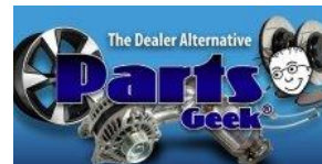
Parts Geek Doylestown, PA 800-541-9352