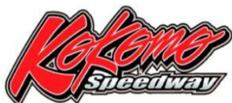
Kokomo Speedway Kokomo, IN 765-459-3877