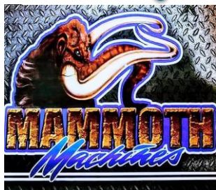
Mammoth Machines Leesburg, FL 407-235-5282

We would like to thank our sponsors for their support. We ask that you please support these businesses so that they can continue to be a vital part of The Villages Motor Racing Fan Club.