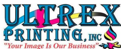
Ultrex Printing Lady Lake, FL 352-205-8222