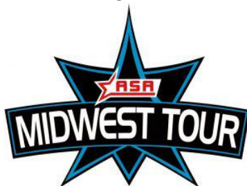
ASA Midwest Tour