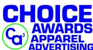
Choice Awards Bellevue, FL 352-245-4496