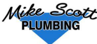
Platinum Sponsor Mike Scott Plumbing Wildwood, FL 352-748-9111