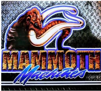
Mammoth Machines Leesburg, FL 407-235-5282

We would like to thank our sponsors for their support. We ask that you please support these businesses so that they can continue to be a vital part of The Villages Motor Racing Fan Club.