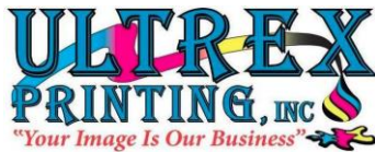
Ultrex Printing Lady Lake, FL 352-205-8222