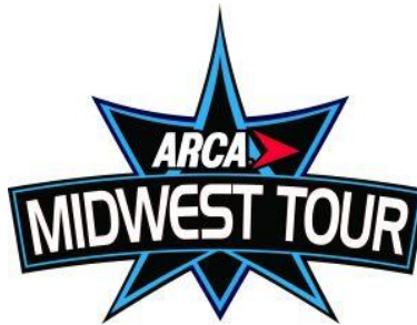
ARCA Midwest Tour