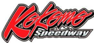
Kokomo Speedway Kokomo, IN