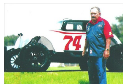
Just a man and his car!