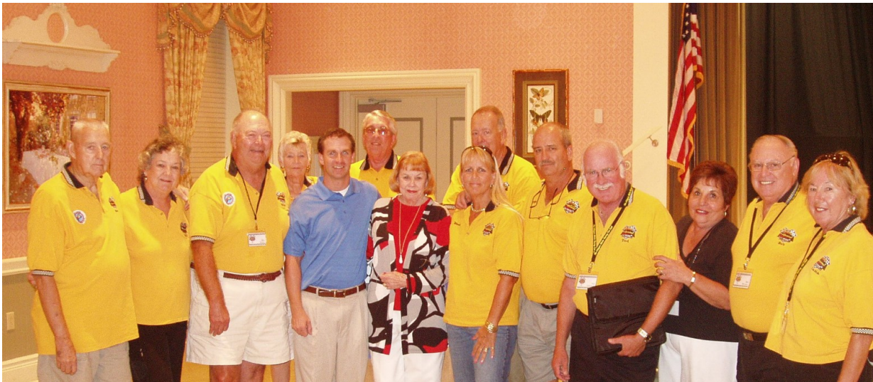
Betty Skelton Erde—1926-2011