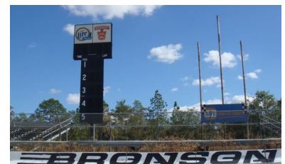
(2) Bronson Speedway's front stretch