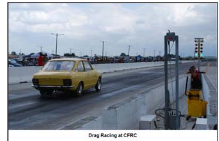
Drag Racing at CFRC