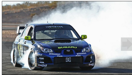
Drifting at CFRC

Did you know that there is a major, multi-use racing facility down in Orlando? In April of this year, Orlando's Central Florida Racing Complex (CFRC) celebrated the one-year anniversary of its 1/8th mile dragstrip, a significant addition to the many racing venues already offered by this racing enterprise. The facility offers, in addition to drag racing, Auto Cross (which we'll learn more about from our October 6 meeting speakers), Drifting (a form of motorsports we hope to have on a future meeting agenda), and go-karting (something we're very familiar with) to complement an entertainment schedule that is quite aggressive. CFRC offers a weekly concert series at its 10698 Cosmonaut Boulevard complex, as well as a regular schedule of motorsports venues. Their website provides an extensive recap of their programs ( http://cfracingcomplex.com ). Here are a few action shots==>