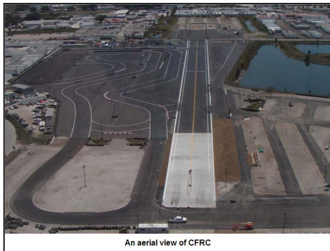
An aerial view of CFRC