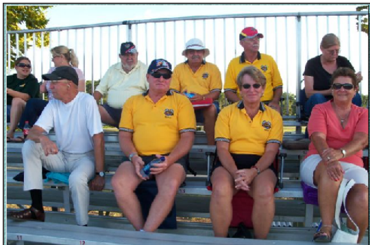
Yellow Shirts in the Stands at Volusia - 9/18/2010