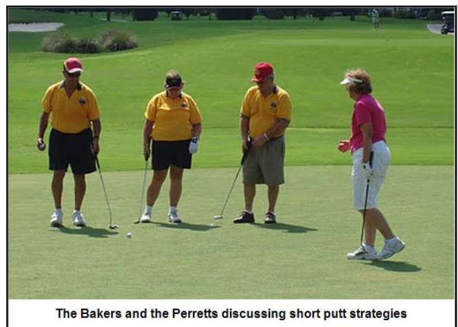
The Bakers and the Perretts discussing short putt strategies