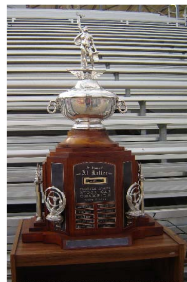
The Florida Governor's Cup Trophy