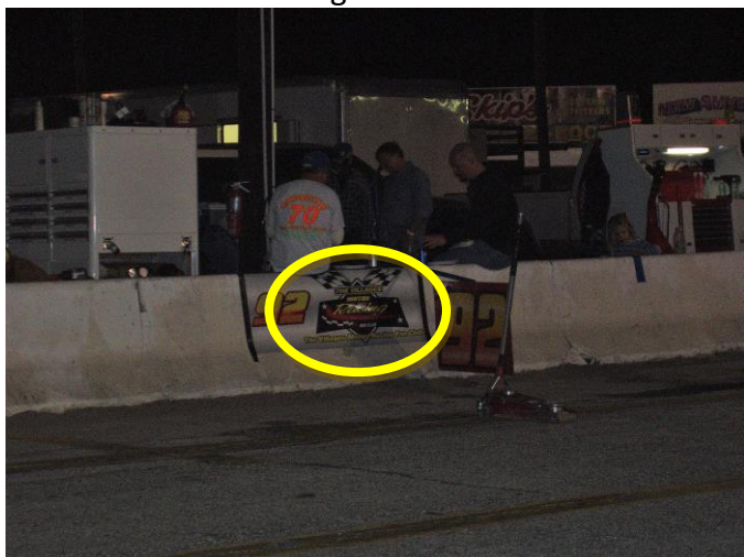
Club Logo on Pit Wall