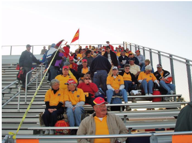
Let's Go Racin'!