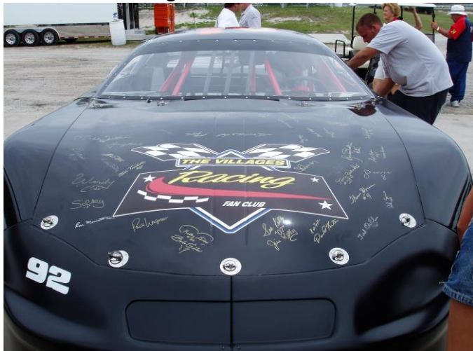
Signatures on Hood