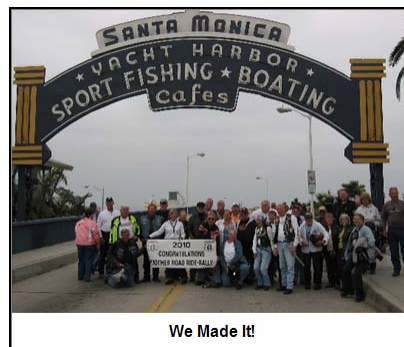
We Made It!