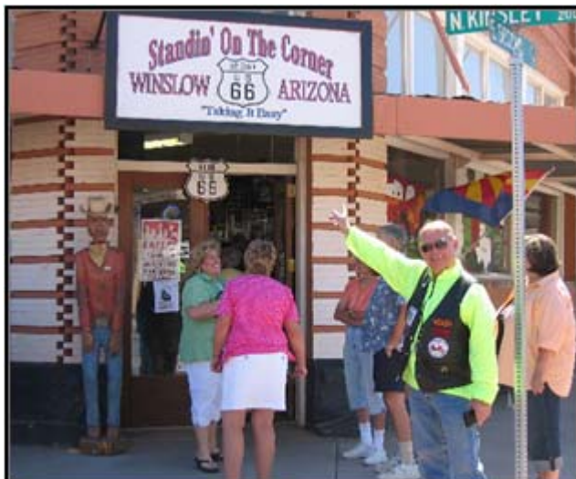
Kind of Makes You Want to Sing!