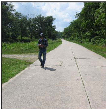
Believe It or Not, This is Route 66!