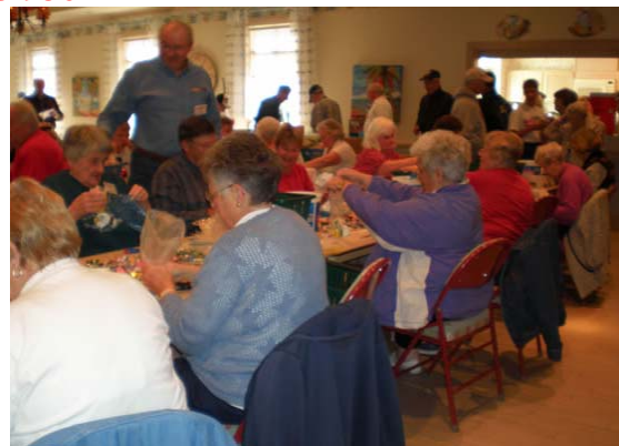
More “action” shots from Operation Shoebox in The Villages