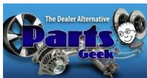
Parts Geek Doylestown, PA 800-541-9352