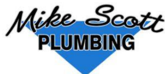
Mike Scott Plumbing Wildwood, FL 352-748-9111