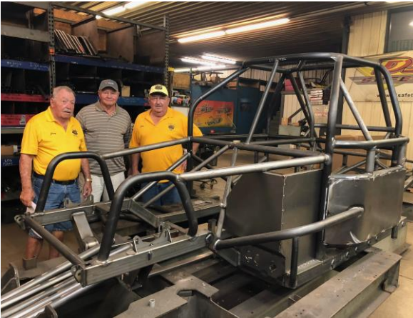
The gang at Lefthander Chassis fab shop in Roscoe, IL. This is the latest state-of-the-art car. Lefthander has 25 dealerships across the U.S.