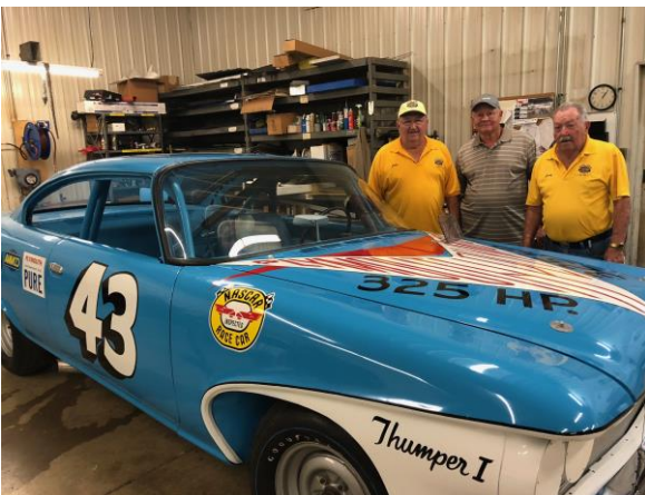
Club members with Richard Petty's 1959 Plymouth. This is the original car he won his second and third races of his career!