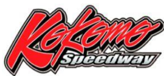
Kokomo Speedway Kokomo, IN 765-459-3877