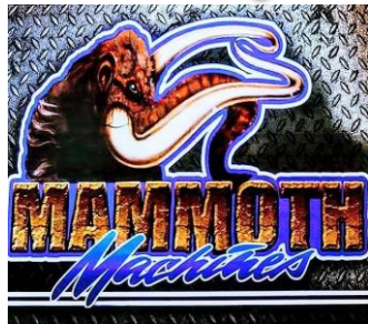
Mammoth Machines Leesburg, FL 407-235-5282

We would like to thank our sponsors for their support. We ask that you please support these businesses so that they can continue to be a vital part of The Villages Motor Racing Fan Club.