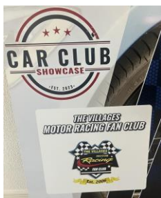
The club's logo