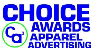
Choice Awards Bellevue, FL 352-245-4496