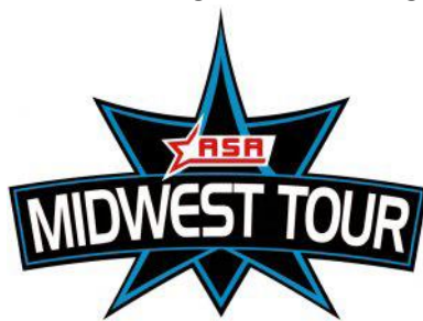
ASA Midwest Tour