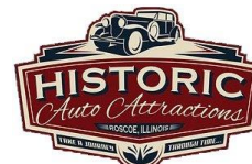
Historic Auto Attractions Roscoe, IL 815-389-7917