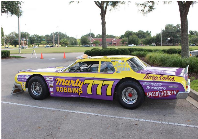
Marty Robbins' Stock Car will be one of the cars on display

We are proud to announce we will be showcasing all forms of racing at our first-ever racing show at Brownwood Paddock Square on Monday, February 1, 2021, 5-8 p.m.