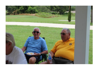
FOOD, FOOD AND MORE FOOD