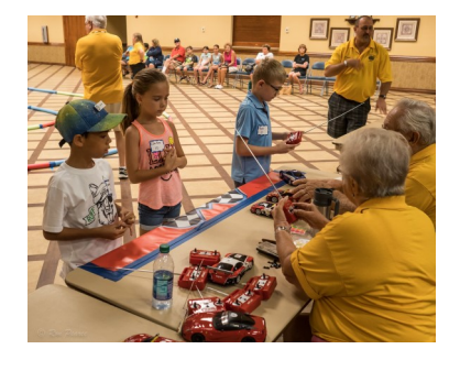
Drivers getting last minute instructions from pit crew