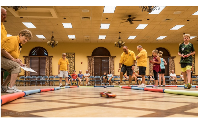
The final race to determine the winner