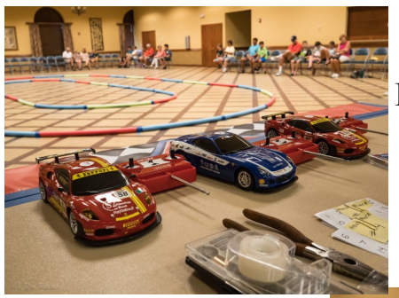
CAMP VILLAGES R/C MOTOR RACING JULY 27, 2017