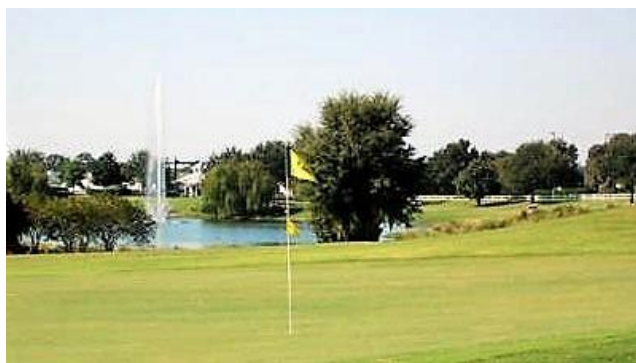
Saddlebrook Executive Golf Course Thursday, May 12, 2022