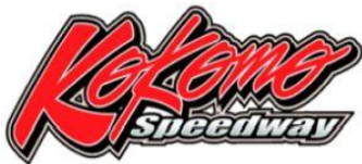
Kokomo Speedway Kokomo, IN