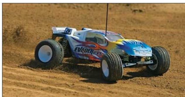
The Duratrax Evader EXT