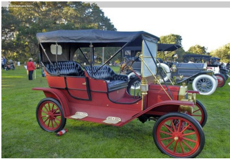
1911 Ford Model T

The Model T pictured at right is 100 years old this year. What a difference a century makes! Consider these statistics: