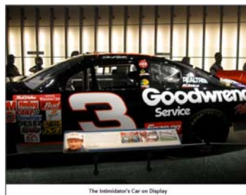
The Inductee's Car on Display