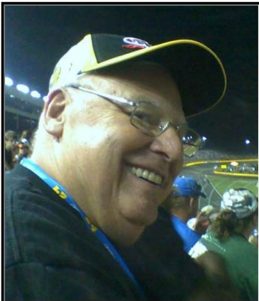
A Happy Race Fan!!!

When the top prize is $1,000,000 dollars, it really makes you want to try hard. The boys came to play and the cars would show the wear and tear. Jimmy Johnson took a leisurely drive through the infield with the help of a few friends. Kyle Bush and Denny Hamlin proved that there was no "Team Spirit" when Denny Hamlin closed the door on teammate Kyle Bush and the field had the "Big One". By the time Kurt Bush took the flag there were 13 cars still in the race and both the drivers and the fans had a good time.