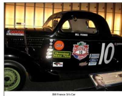
Bill France Sr's Car