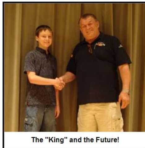
The "King" and the Future!