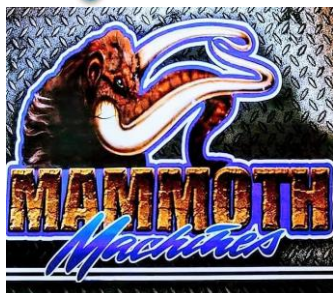
Mammoth Machines Leesburg, FL 407-235-5282

We would like to thank our sponsors for their support. We ask that you please support these businesses so that they can continue to be a vital part of The Villages Motor Racing Fan Club.