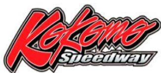
Kokomo Speedway Kokomo, IN