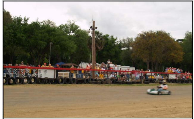
Some of the 100+ spectators watch a Cup driver exit turn 2

The great folks at Speedway Park were incredible hosts for the day, preparing the karts, flagging the races, and (most importantly) helping us Villagers get into and out of the karts. The Villages Media Group was also on hand to cover the inaugural event, which was covered in the April 19 edition of The Daily Sun and which will be the subject of a lengthy article in the June edition of The Villages Magazine, thanks to Marianne Lobaugh.