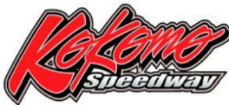
Kokomo Speedway Kokomo, IN 765-459-3877