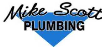
Platinum Sponsor Mike Scott Plumbing Wildwood, FL 352-748-9111