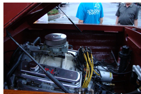
The "My Precious" race boat on display at Colony Cottage...check out the power plant!