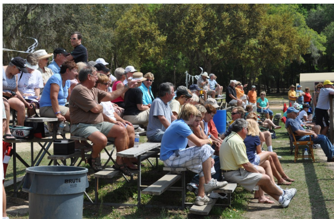
The event attracted a huge crowd of spectators!