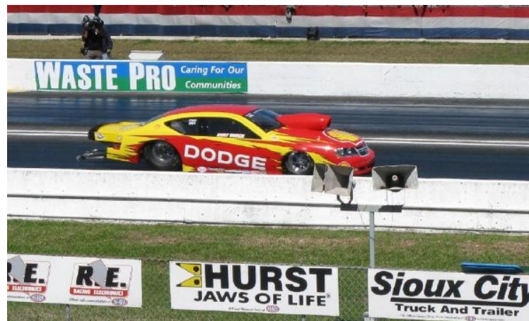
Kurt Busch tries his hand at going straight! He actually did quite well for the first time out.