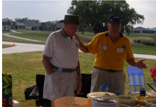
The "special guests"