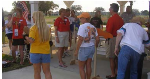
The fun had by all!