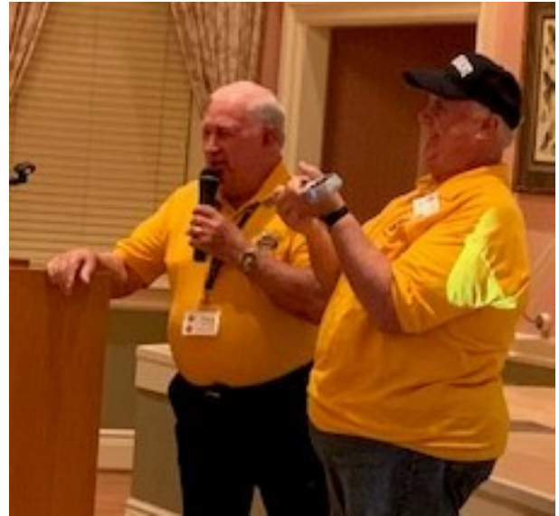
It's Official Passing of the Crew Chief Wrench