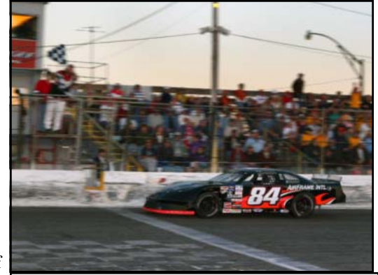
Wayne Anderson Taking the checkers!

Citrus County Speedway, Feb. 20, 2010—It was a day made for racing...clear blue sky, temperature in the 70 degree range, light breeze. It was also a day made for Florida racing history, with the kickoff of the newly-formed Sunoco Florida All Stars Tour at this venerable Citrus County racing venue. This inaugural event—the Racecar Engineering 100—featured a field of combined Super Late Model, Limited Late Model, and Crate Late Model drivers embarking on what will be a twelve-race, nine-month tour of six Florida asphalt speedways, crowning a state Late Model Champion in October. On hand for the big event were about 30 club members, most of them decked out in their yellow club shirts!