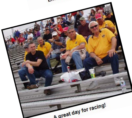
A great day for racing!