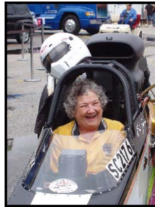
Wait till my Biker Buddies see me in this!