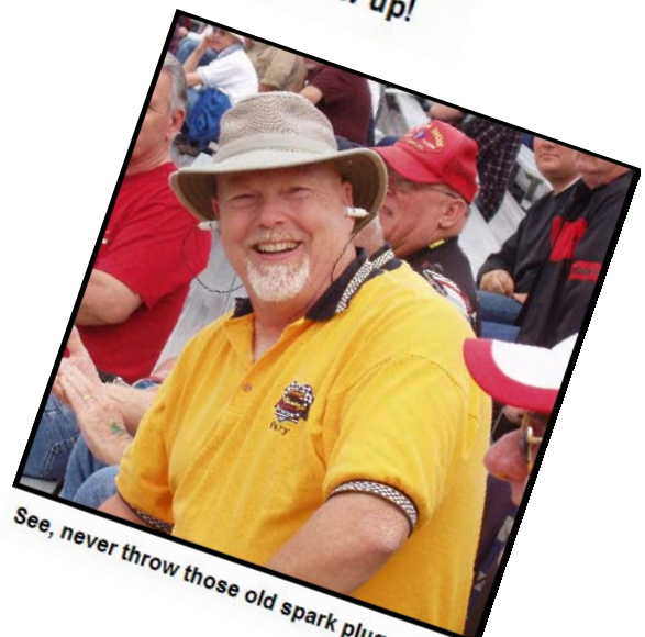
See, never throw those old spark plugs away!