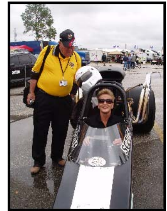
I want one of these!