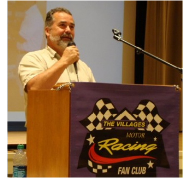
Southern Dirt Track Association of Florida