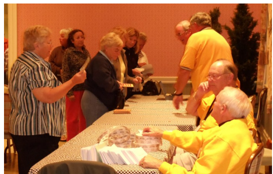
Right top: A look at the crowd. Yes, we actually ran out of seats!