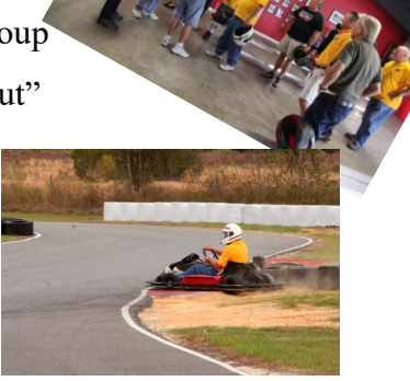
Then there were 6