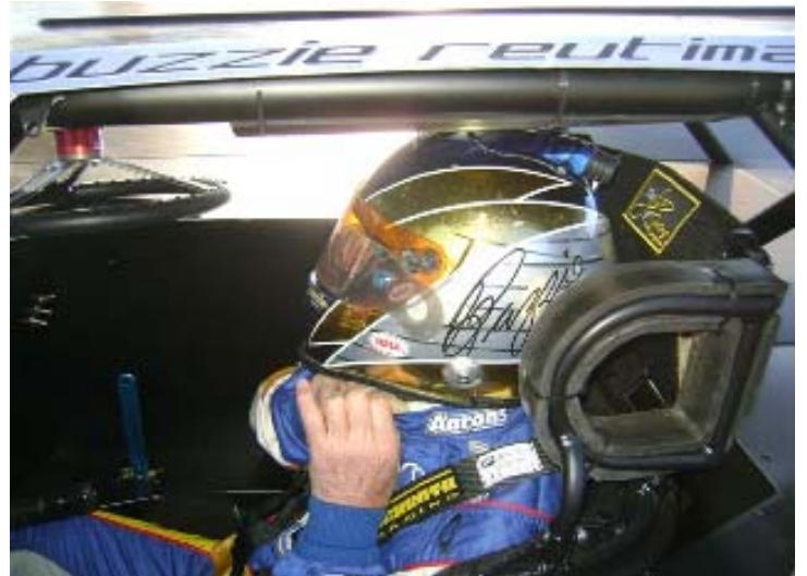
Looks like he even got a chrome helmet!