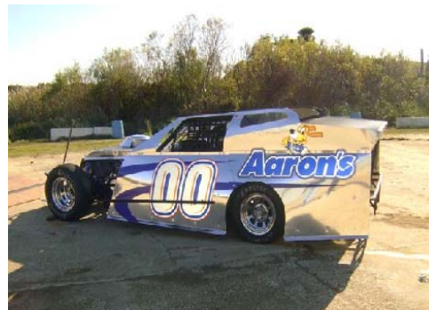
Buzzie’s new Chrome Car See additional photos on next page