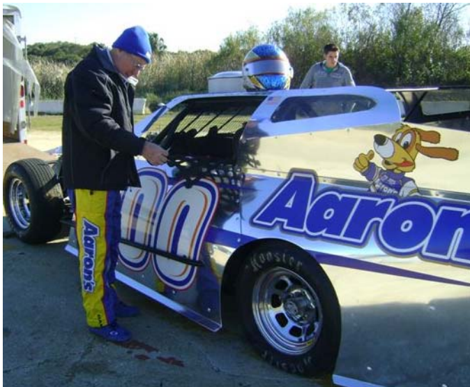
Yeah, it was cold down at "The Clay By The Bay"