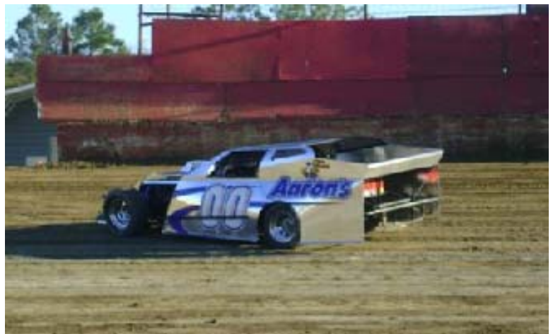
The man himself, taking to the track! The car is still clean at this point.