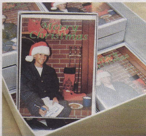
These Christmas cards are fundraisers for the Florida Sheriffs Youth Ranches.